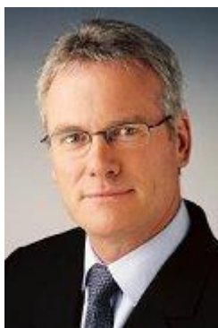
Hon. Steve Maharey Minister of Social Development & Employment Minister of Youth Affairs