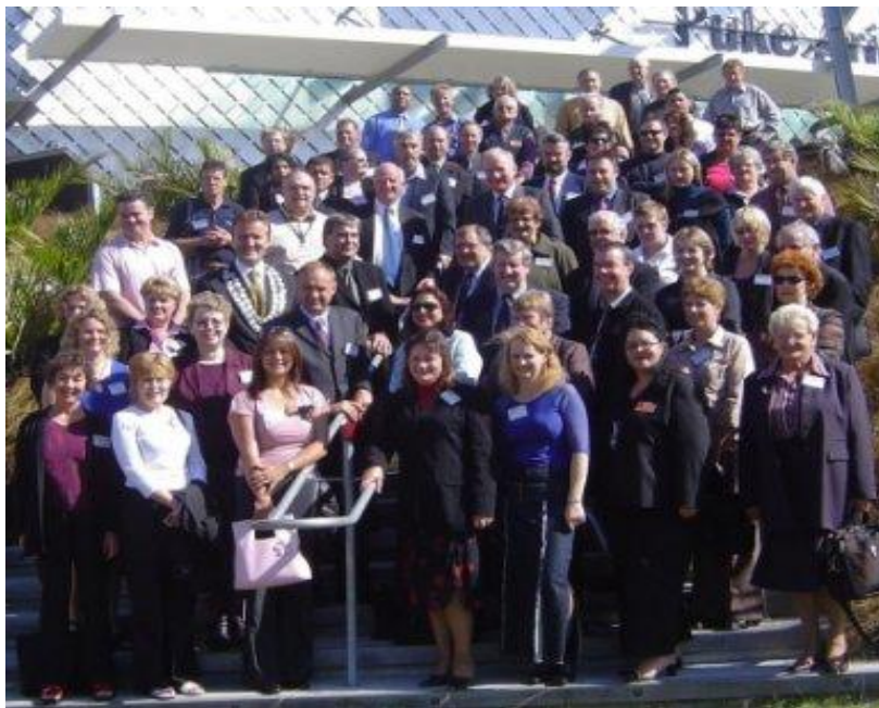
Best Practice Gathering – New Plymouth 2004