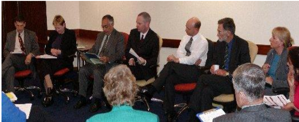
Panel of Chief Executive Officers and leaders of Government Departments