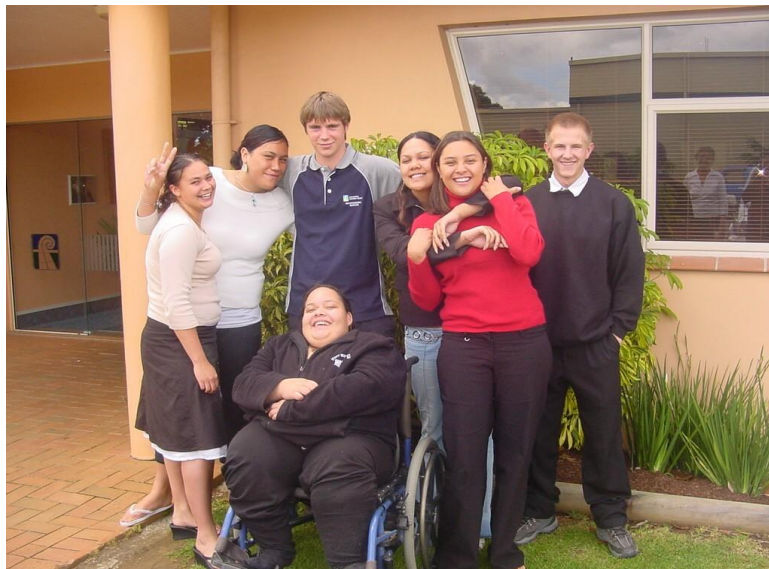
Northland Cadets, Far North District Council