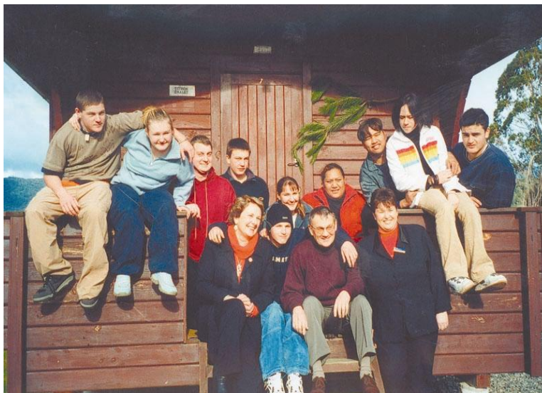
“Alive At Borland”, Southland