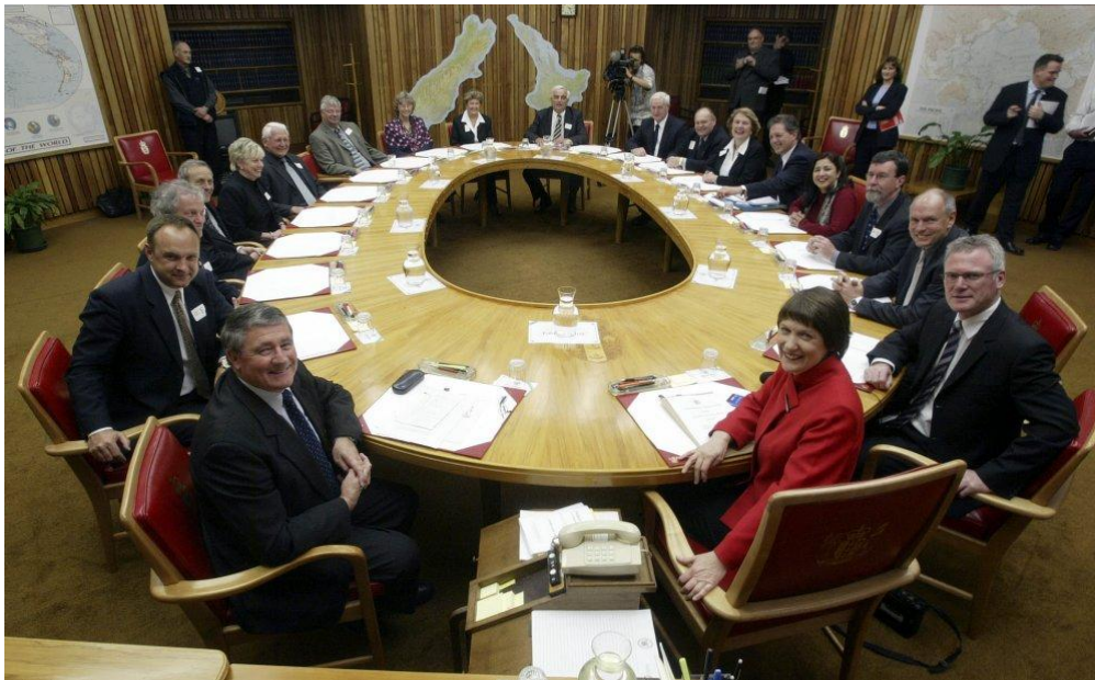
Memorandum of Understanding Sign-up Beehive Cabinet Room October 2002