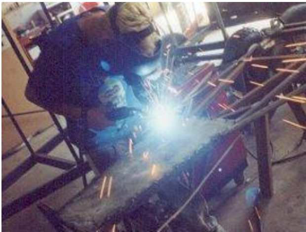
Young apprentices learning their trades