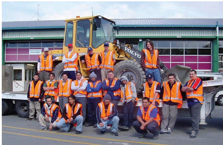
City Care pre-apprenticeship work skills programme, Christchurch