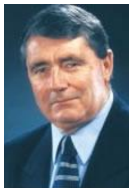
Hon. Jim Anderton Minister of Economic Development